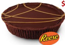
REESE PEANUT BUTTER TART (VEGAN & GLUTEN FREE)