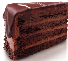
SO GOOD CHOCOLATE CAKE

A marriage of two great KS foods... our apple crumble pie with our world famous pizza. Picture our apple pie filling with a caramel sauce spread over our pizza dough - topped with cinnamon & cinnamon bun icing glaze.