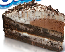
COOKIES & CREAM CHEESECAKE